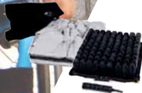
Pressure care cushions from R7100