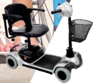
Mini Scooter R18630