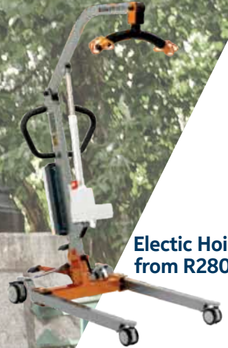
Electric Hoists from R28000

*Be sure to visit our Facebook page for the winner of our “Under Pressure” competition A lucky reader wins a Jay or Roho cushion!