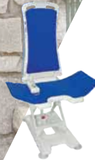
Special Bathlift R8900